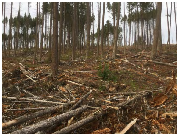
Fig 15. 60% retention with thinning.