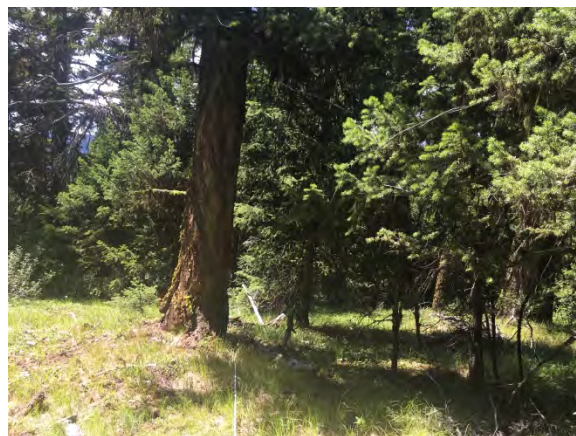
Fig 4. Venables. Multi-layered pure Douglas-fir dominated plant layer.