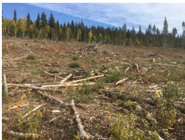
Fig. 12. Clearcut.

Logging has been completed at six of the nine locations and is planned for late 2019 at the other three. Leave trees and residual patches were marked out prior to harvest. Figures 12 to 15 illustrate the four silviculture systems at the John Prince site.