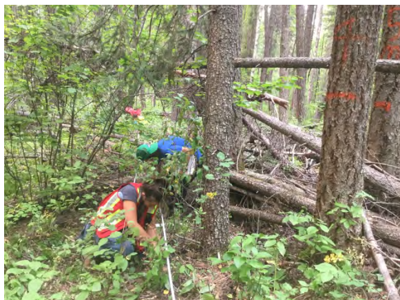
Figure 16. Sampling forest floor along the CWD transect.

One circular 1 m 2 ( r=0.56 m) microplot was established at each end of the 30 m transects (total four microplots per NFI plot). Within each microplot, a 20 x 20 cm sample of forest floor extending from the ground surface to the mineral soil interface was collected. Samples were oven dried and weighed in the lab and analyzed for percent carbon and nitrogen content. All bryoids, herbs, trees/shrubs \leq 1.3 m in height, and fine woody debris ( < 1 cm diameter) were collected from the microplots, oven-dried and weighed.