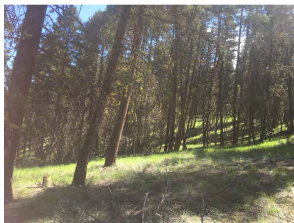
Fig. 5. Peterhope Lake. Multi-layered nearly pure Douglas-fir.