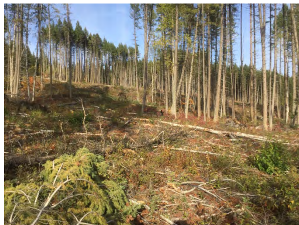
Fig 14. 30% group retention.