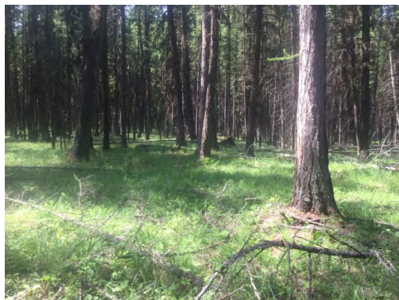
Fig. 3. Jaffray. Moderate-sized Douglas-fir with a minor western larch component, sparse understory regeneration and a pinegrass-dominated plant layer.

The interior sites are in the Interior Douglas-fir (IDF), Interior Cedar-Hemlock (ICH), and Sub-Boreal Spruce (SBS) biogeoclimatic zones and the coastal one is in the Coastal Western Hemlock (CWH) zone. The selected sites are circum-mesic and before logging were occupied by mature Douglas-fir with varying components of other species.