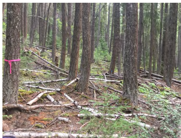
Fig. 10. John Prince. Douglas-fir with a minor spruce component and patchy understory subalpine fir and plants.