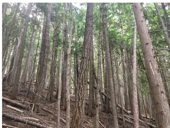
Fig. 8. Narrows Creek. Dense Douglas-fir, western redcedar, western hemlock, and western larch with sparse understory trees and plants.