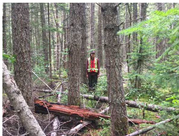
Fig. 9. Alex Fraser (ICH replicate). Douglas-fir with minor spruce component, understory subalpine fir and a lush plant layer.