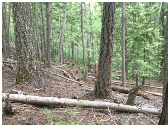
Fig. 7. Redfish Creek. Douglas-fir mixed with western redcedar and other species; cedar regeneration and patchy understory plants.