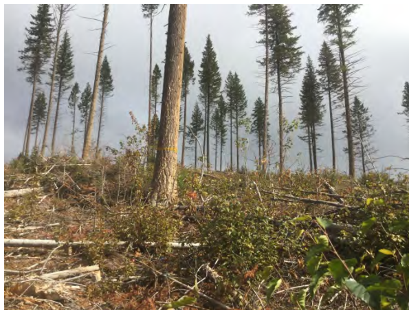
Fig. 13, Single tree retention.