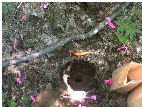
Fig. 17. Microplot sampling. The plants, fine woody debris, forest floor, and two layers of mineral soil have been collected.

Mineral soil was collected from the microplots in approximately 10-cm diameter holes at depths of 0-15 cm, 15-35 cm and 35-55 cm. The volume of each sample was measured in the field by lining the excavated holes with plastic and using a graduated cylinder to measure the volume of water that filled the hole. The mineral soil samples were oven-dried, weighed, and percent carbon and nitrogen was determined.