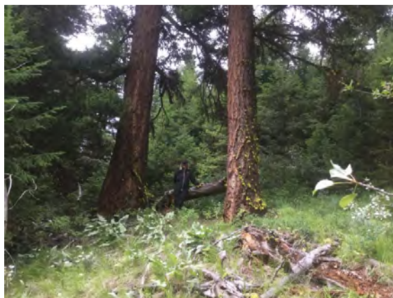
Fig 1. Mother trees at the Venables site.

We sincerely thank all of the people who have worked with us since October of 2015 to get the Mother Tree Project off the ground. We would like to share with everyone what we have accomplished so far as a group.