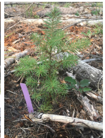
From left to right: Seedling (photo credit: Steph Troughton), Seedlings and trowels (photo credit: Steph Troughton), Planted seedlings (photo credit: Jean Roach)