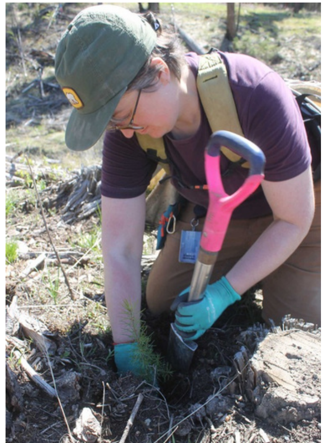
Planting seedlings

Overstory retention impacts resource availability for new seedlings, which needs to be considered when choosing a silviculture system. Overstory trees can help to create more humid microclimates in ecosystems that are moisture limited by reducing temperatures under the canopy. As the climate changes, seedlings in areas that will face higher drought frequency will benefit from having an overstory to regenerate under. However, in areas where moisture is not a limiting factor, light competition is a more important element for seedling growth. Our findings are particularly important given that the climate is expected to become more arid throughout much of the range of interior Douglas-fir in B.C.